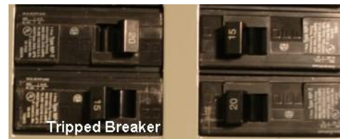
Figure 4- Tripped breaker

To do this, locate and open the door on your electrical panel. Look for a breaker that has moved from the “on” position to the “off” position (also known as a tripped breaker), or is halfway between the two.