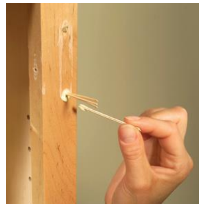
Figure 7 - Fix a stripped screw hole with glue and toothpicks

This link has a good video on how to repair cabinet doors and hinges: