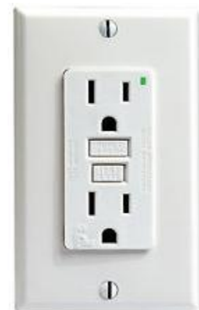
Figure 3 G.F.C.I plug

If the GFCI receptacle is working properly, pushing the “test” (bottom) button will cause the top button to pop out. You should hear a sharp “click” upon pressing the test button. After you have pressed the reset button, check to see if all your plugs are now working.