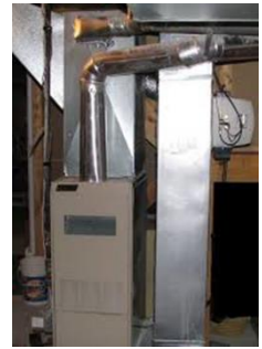
Figure 5 - Forced air furnace

https://www.youtube.com/watch?v=-lO4xAsTyqM