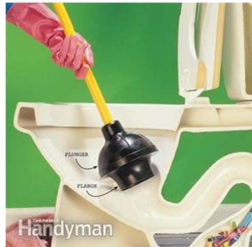
Figure 8 - Grab the plunger