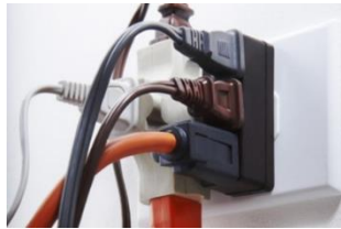
Figure 1 - Overloaded plug

When a circuit becomes overloaded it breaks the circuit breaker. This happens when there are devices such as phones, laptops, gaming systems, televisions, coffee pots, hair dryers and surround sound systems all