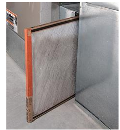
Figure 6 - Furnace filter